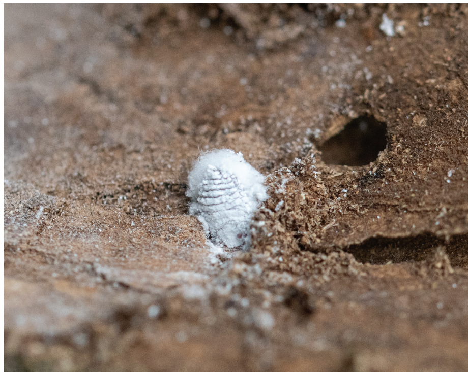
Figure 3. Live adult female of Paracoccus wui Zhang, sp. nov. in bark crack of Dalbergia hupeana Hance (Fabaceae).

slightly sclerotized area. Anterior abdominal cerarii (Fig. 4J) each usually containing 2 smaller conical setae, 4–8 trilocular pores, and sometimes with small slightly sclerotized at setal bases; the setae in anterior abdominal cerarii sometimes widely spaced, or each reduced to only 1 conical seta, or replaced by 1 or 2 stout setae. Cerarii on thorax and head difficult to recognize because some marginal dorsal setae sometimes associated with 2–4 trilocular pores near setal bases, which can be confused with a cerarius; if cerarii present, each often with a pair of stout setae similar to those on dorsum, but recognisable as cerarius by a small concentration of trilocular pores, and sometimes the ocular cerarii ( C_3 ) present, each with 3 or 4 slender setae. Discoidal pores (Fig. 4D) of varying sizes, with larger pores each usually wider than a trilocular pore (in one paratype most larger pores about same diameter as a trilocular pore and only a few pores wider than a trilocular pore), scattered on dorsum and venter.