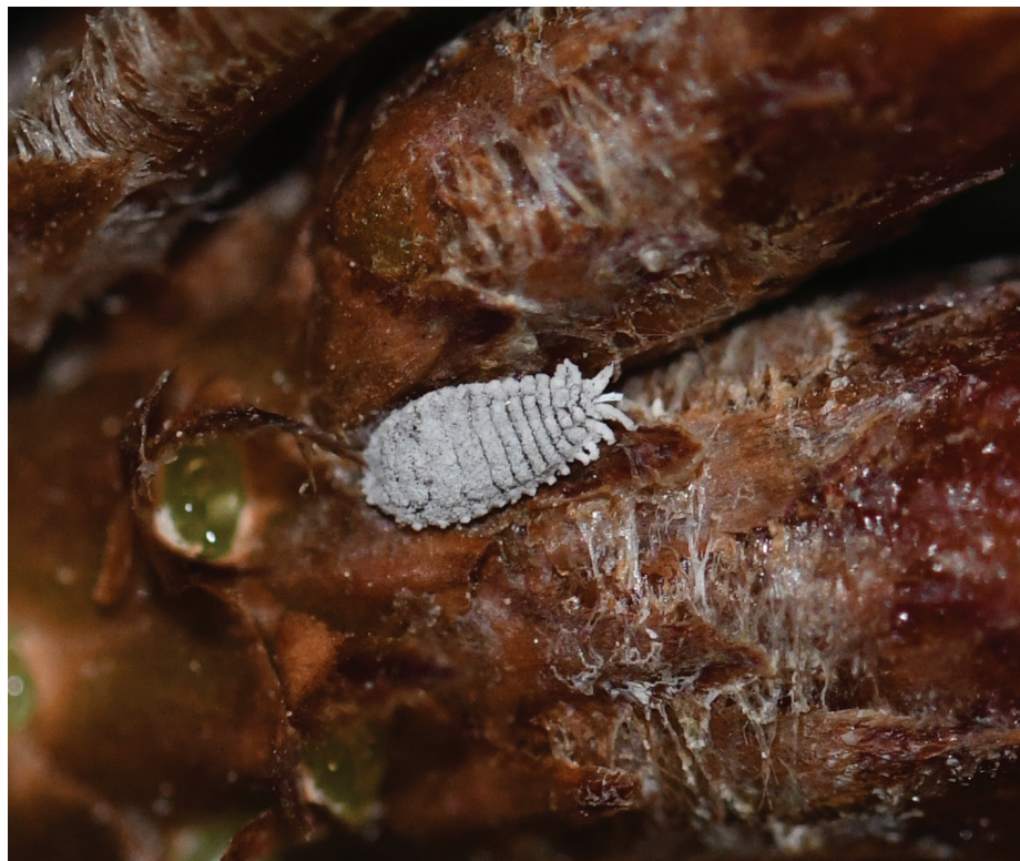
Figure 1. Live adult female of Paracoccus gillianwatsonae Zhang, sp. nov. on a needle of Pinus massoniana Lamb. (Pinaceae).

bases not closely associated with trilocular pores. Trilocular pores (Fig. 2B), each 3.0–3.5 \mu\text{m} wide, evenly distributed. Oral rim tubular ducts (Fig. 2J) present, numbering 11–24 in total, each duct 11–12 \mu\text{m} long and about 4 \mu\text{m} wide, with rim 8–9 \mu\text{m} in diameter, usually present singly near margins of head, thorax, and close to cerarii on posterior abdominal segments, and others usually present in medial or submedial areas of thorax and abdominal segments II and III, or only on abdominal segment II.